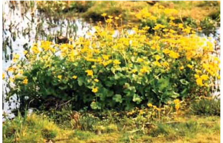
The vivid yellow Marsh Marigolds are among the earliest of the Centre’s spring blooms

The first ever Bloomin’ Wetlands Weekend is taking place 26 & 27 April. Focusing on the plants and ecology of the Reserve, there will be plenty of things to see and do. Specialists will be