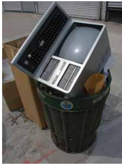
Definitely NOT the way to do it...

Recently (the timing not aligning with a jumble sale) I used the Internet trying to find a home for a well-maintained electric cooker – ceramic hobs, double oven, timers, bells and whistles. The instruction book was