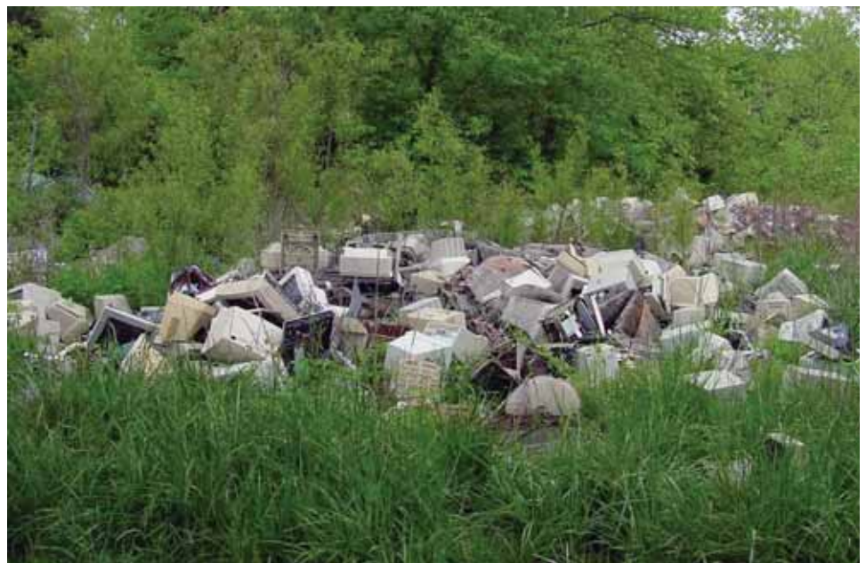
...and neither is this – an illegal computer dump in the USA