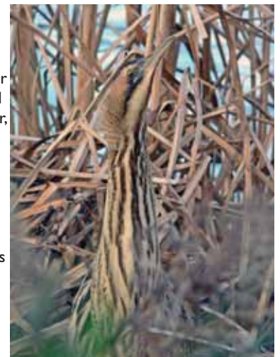
This Bittern dares you to find him among the reeds!