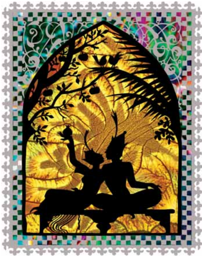
Aladdin and his bride

Local artists/illustrators/authors Jan Pieńkowski and David Walser have produced another delightful book in time for Christmas, The Thousand Nights and One Night .