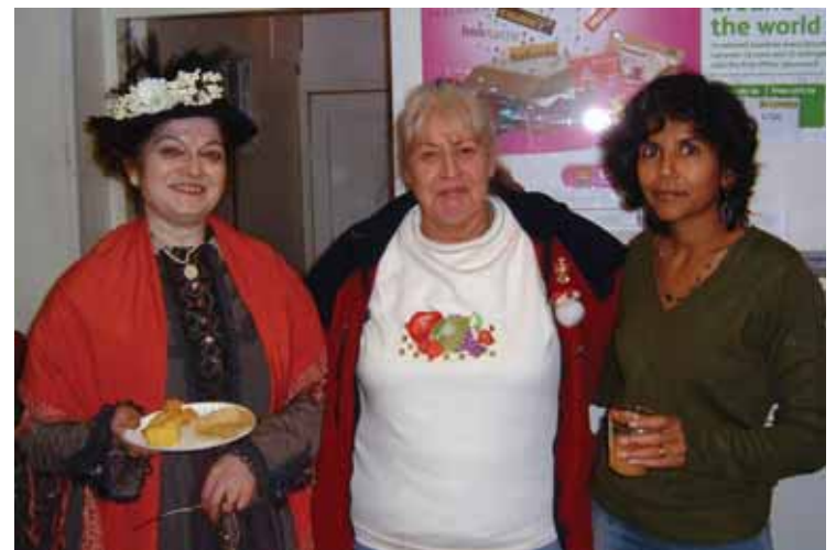
The ladies of Castelnau Post Office in party mood