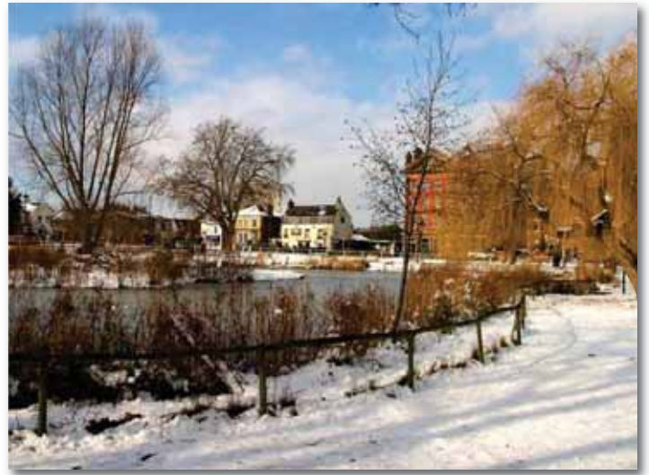
The BCA contributes to the maintenance of Barnes Pond

PLEASE RETURN THE ENCLOSED MEMBERSHIP FORM TO ENSURE THAT BARNES STAYS "A PLEASANT PLACE TO LIVE".