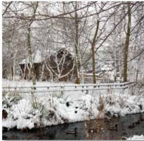
Perhaps Santa's Grotto will have a covering of snow this year