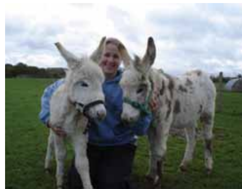
Donkeys from Miller's Ark Animals contribute a bit of magic to the half-term weekend.