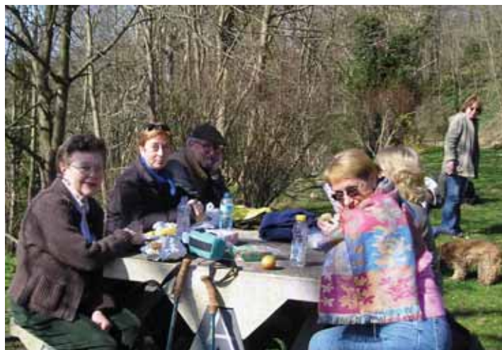
Lunch break for all during a Spring 2007 walk near Le Pecq