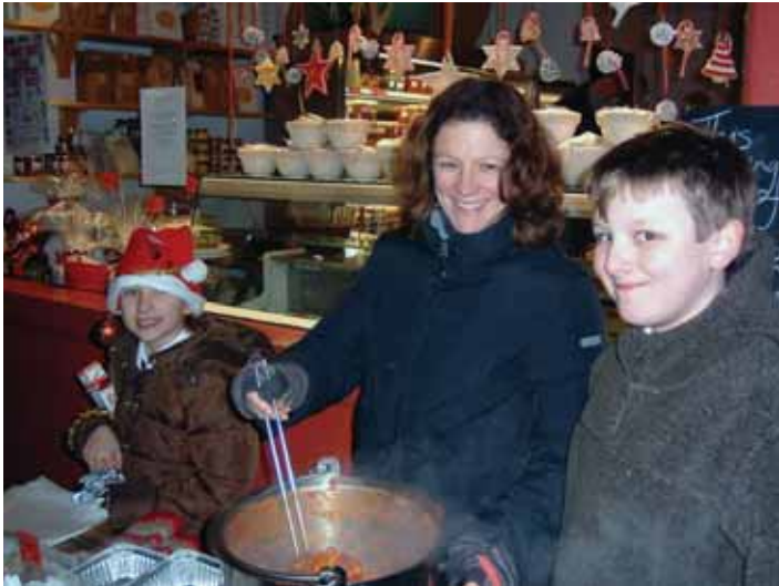
Late Night Christmas festivities in White Hart Lane