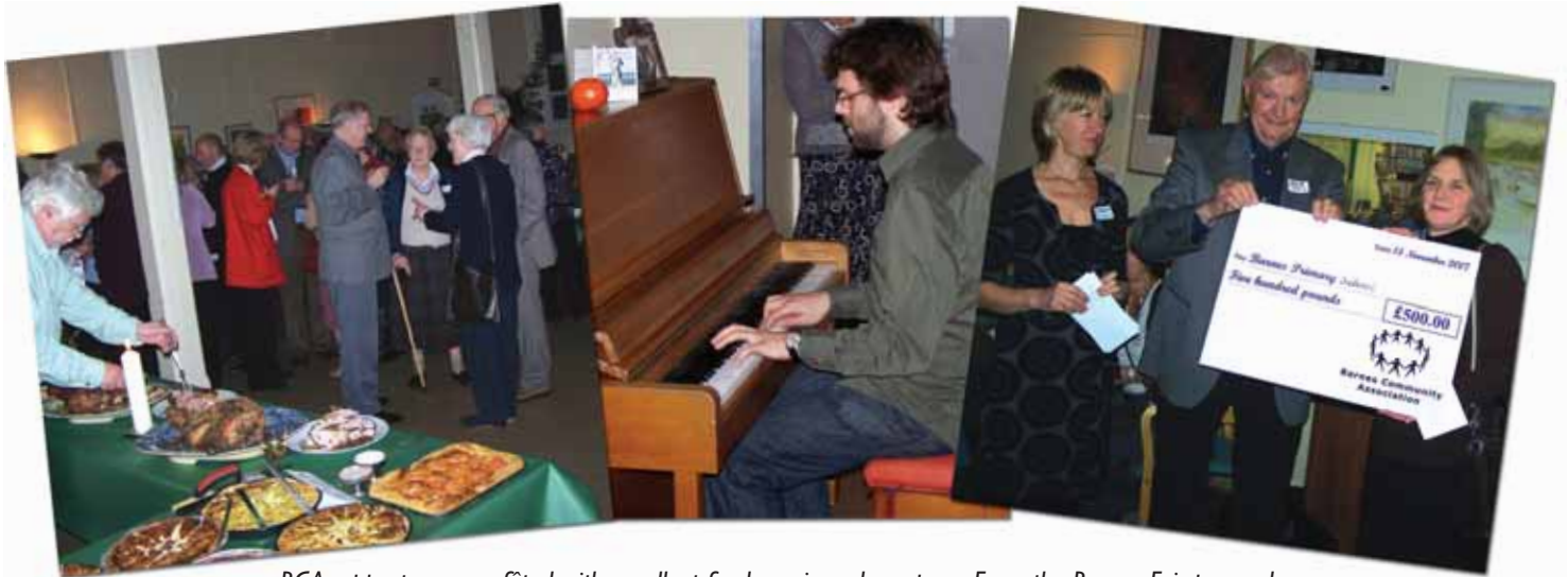
BCA supporters were fêted with excellent food, music and company. From the Barnes Fair proceeds, cheques were awarded to Barnes Primary (pictured), Lowther, and St Osmund's Schools, St Mary's Scout Group and to Barnes Guides and Brownies

The first of its kind, a major BCA supporters' event was held at the Barnes Green Centre on Thursday 15th November. All active volunteers and new members joining in 2007 were invited and 150 attended on the evening. The event replaced smaller gatherings traditionally held for New Members, Jumble Sale Helpers, Fair Volunteers and the Reception and Prospect teams at various times throughout the year. Other key contacts, including the Friends of Barnes Common, litter pickers and our many sponsors were also invited.