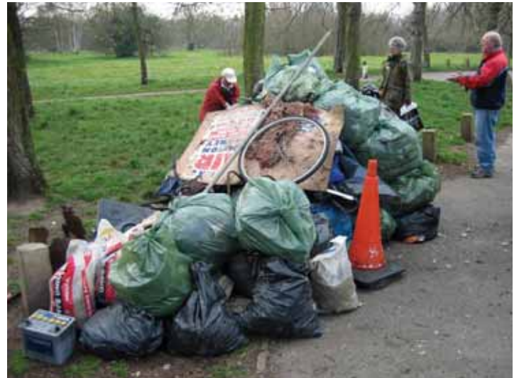
Bags of rubbish collected by our energetic litter-picking volunteers last year

The Friends of Barnes Common will once again be organising the annual clean-up of Barnes Common and, therefore, many volunteer litter pickers and/or trophy hunters are again needed to help restore our Common to a near-pristine state. Last year great fun was had by the young boys from St Paul's junior school, Colet Court, in obtaining