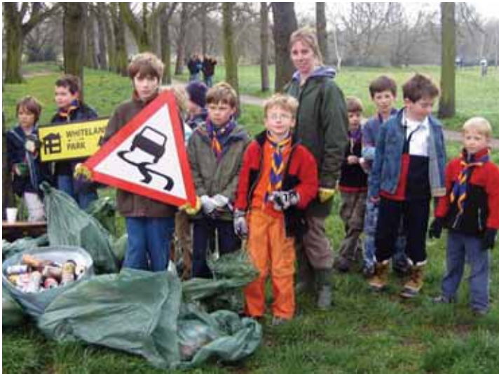
Boys from Colet Court and local Cubs seek treasures amongst the rubble