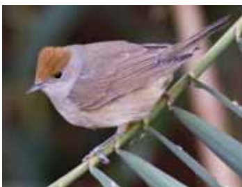
A female blackcap showing a reddish 'cap'

We may have lost our house sparrows and continue to mourn the sadly depleted numbers of songbirds, but a Prospect reader was very excited to spot a pair of Blackcaps visiting her garden feeder during the recent cold snap.