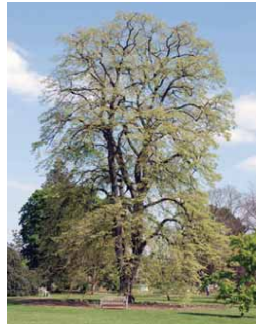
A weeping silver lime in Kew Gardens