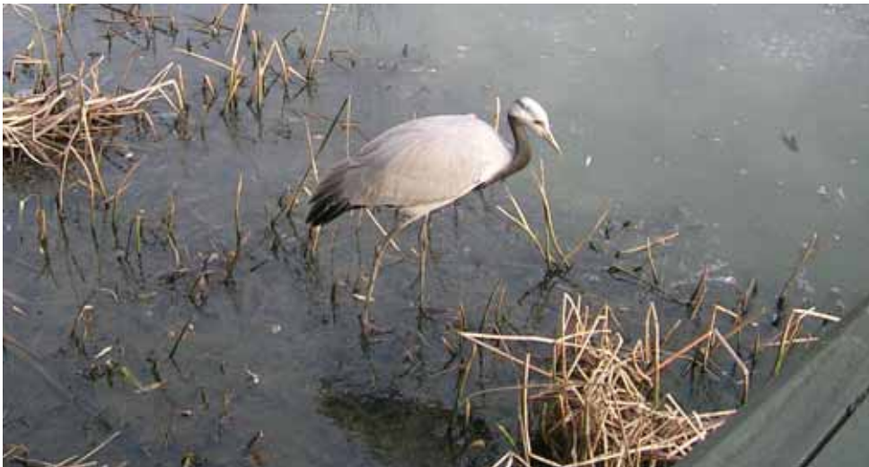
...but surely cranes are safer on the ice than people!

Bird enthusiasts will enjoy the several talks and courses that are coming up at the Centre. For more information on any future event at the Centre please see the website www.wwt.org.uk or call 020 8409 4400