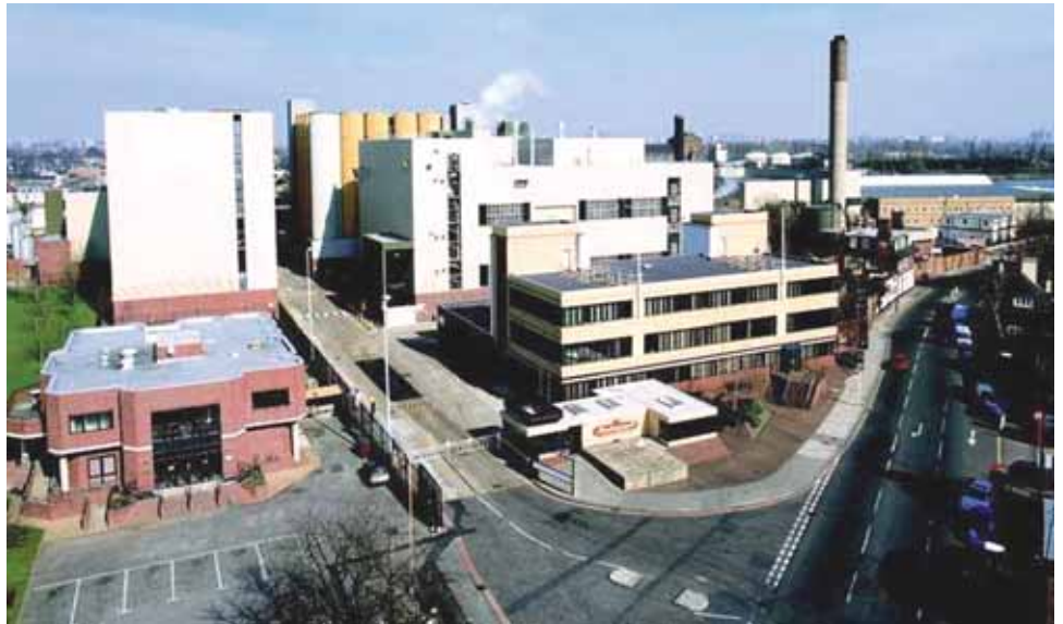
Modern brewing and the road