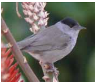
The male has the black cap which give the species its name

At first glance the male was mistaken for a tit but then positive identification was made and backed up by seeing his mate, a small greyish/brown bird (as many of them are) but with a distinctive reddish flush to her head.