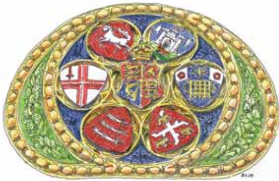
Artist's impression of the arms as they were before being painted over (see below)