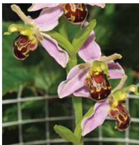
Keep an eye out for the wonderful bee orchids, often seen in the wilder parts of the site, although this one was in the car park.