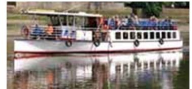
The Princess Freda

For up to the minute information check on www.chiswickpier.org.uk