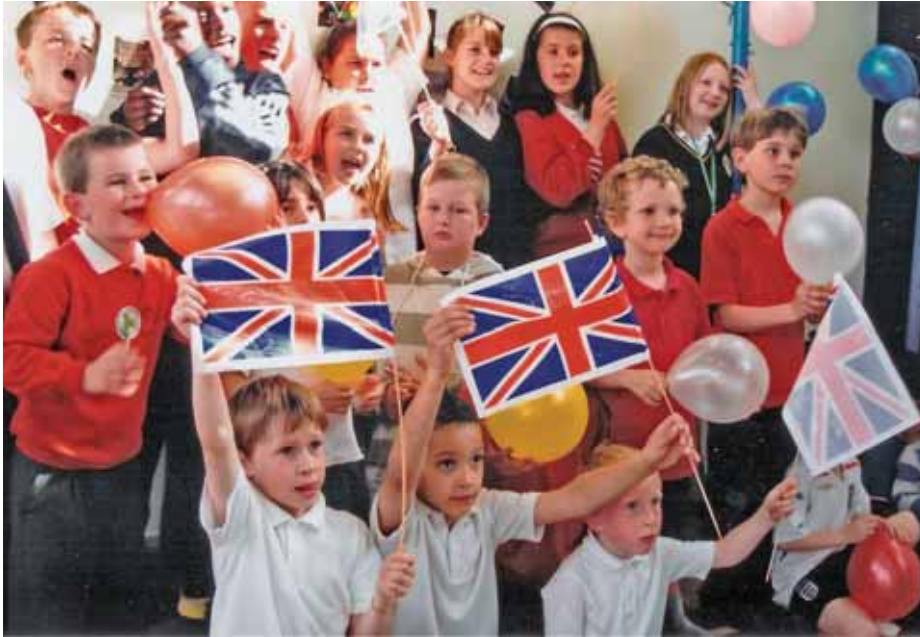
Elderly local residents have, during this term, been talking to children at Lowther School about growing up in WW2. At the end – of course – they enjoyed a 'Street' Party.