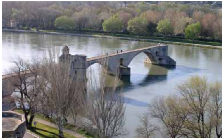
The famous bridge at Avignon

I am hoping to go on a trip in September, organised by the Rhône-Alpes Tourist Board and Rail Europe, to appraise a tour for May 2010. If I think it would be suitable all members on the