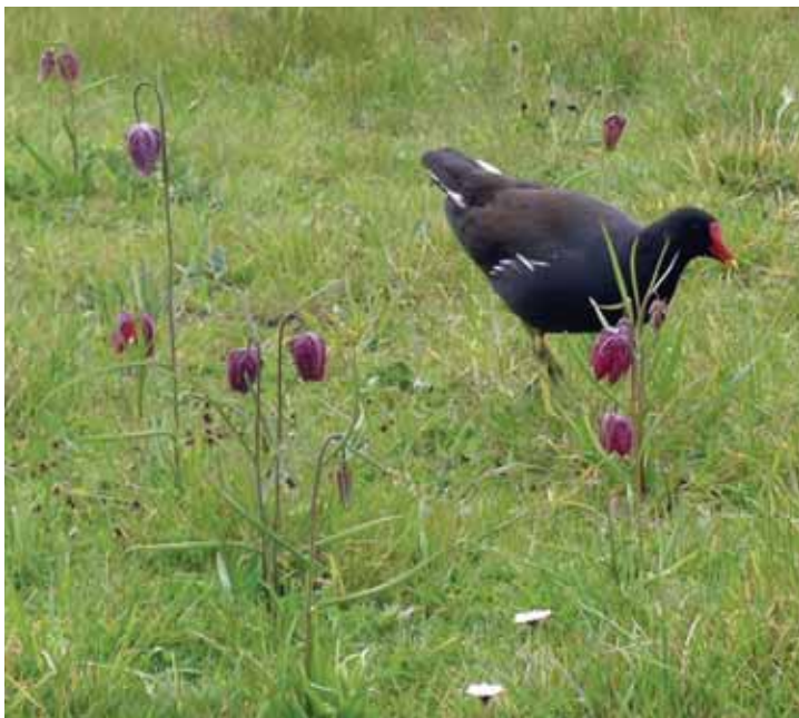
A Moorhen invades the fritillary meadow