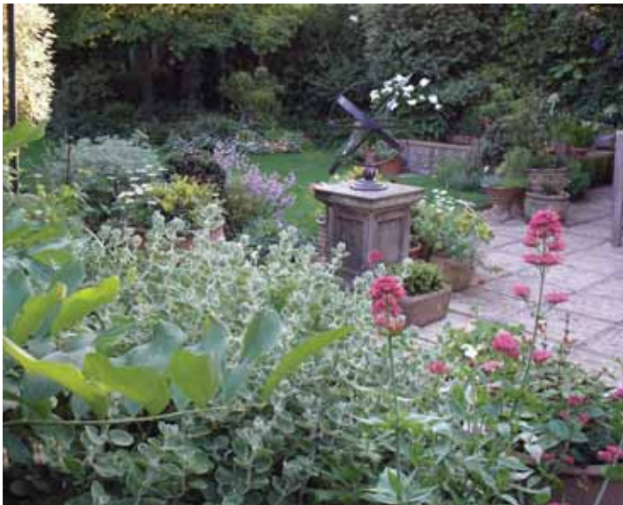
The garden in Woodlands Road

The National Gardens Scheme is a charity founded in 1927 which raises money by opening gardens to the public. It is hoped in this 80th birthday year to raise even more money than last year when London gardens alone contributed over £103,000 to the beneficiaries.