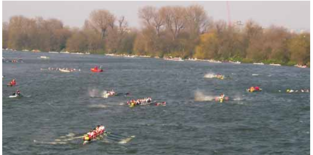
Getting into difficulties

This year the weather was sunny, but cold with a stiff wind. The race started but soon had to be abandoned as boat after boat got into difficulties on the bend by Small Profits Dock.