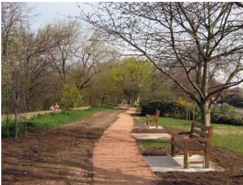
The Gardens ready for the Boat Race – no point in planting grass before the crowds arrive

*The small profits alluded to in the name of these gardens are not thought to refer to any lack of viability of river trade; instead, there may have been a field of that name nearby.