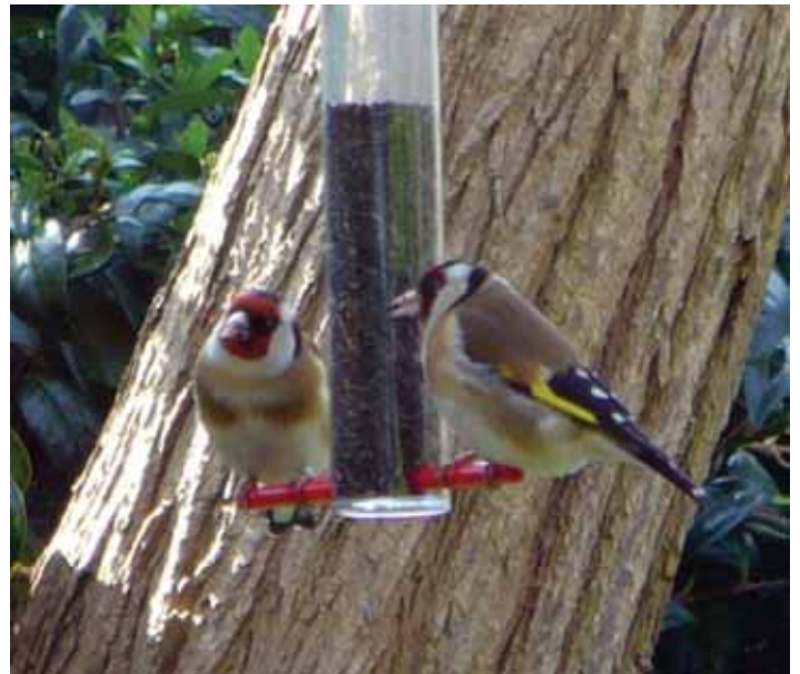
A pair of goldfinches in a Barnes garden