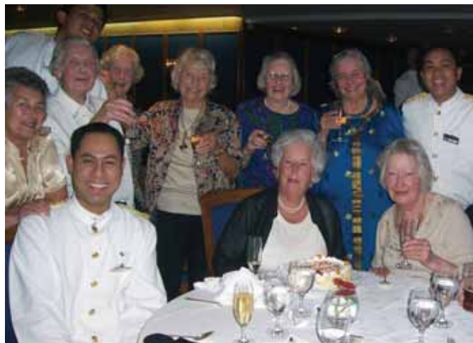
A birthday to remember