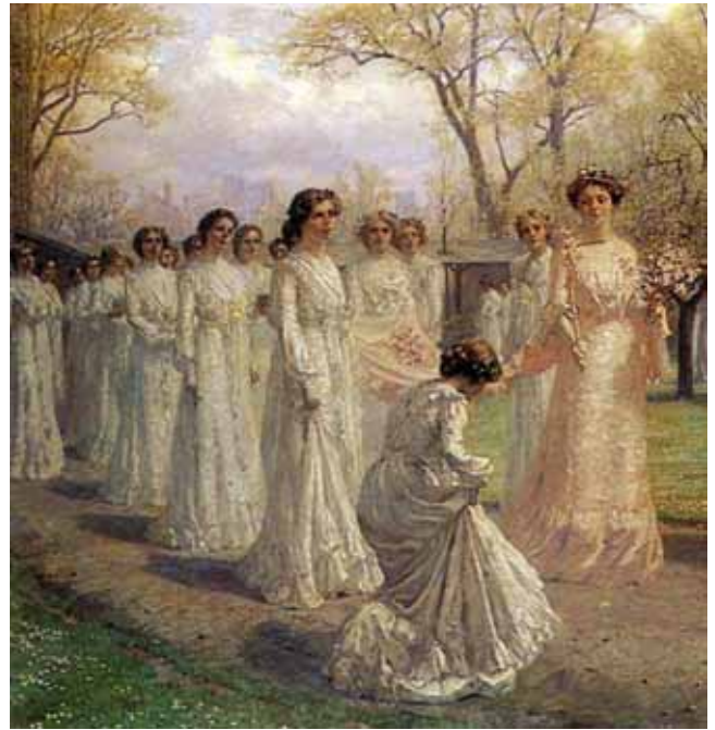
May Day Procession, 1902