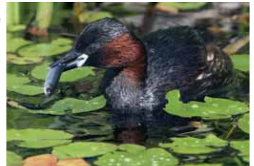
Little Grebe savouring his catch!

Weekends are full of opportunities to learn more and improve skills. The Introduction to Birdwatching courses run on 4th, 10th and 25th November, and the Wildlife Walks for WWT Members are taking place on the 11th